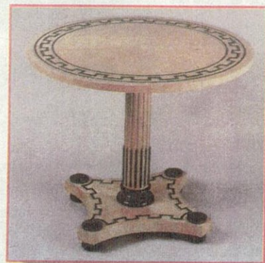
Photos: “Il Fióre” coffee table of wood and stone flower bouquet set into a walnut base (top of page). Above “Peach Blossom” entryway desk and right “Greek Key” occasional table made from ebony and bird’s eye maple.